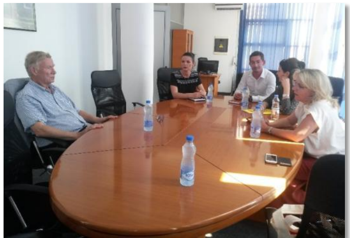
Meeting at the Gracanica Municipality