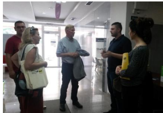
Meeting at Formon